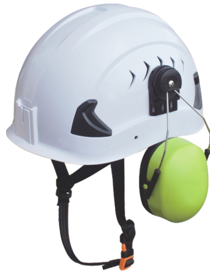
NT22-5V + Earmuff

ANSI/ISEA Z87. 1-2015 CE EN 1731 : 2006F