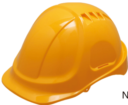
NTC – 4

This European-style safety helmet is made out of durable ABS material. Universal slots allow hearing, welding and visor accessories to be attached easily.