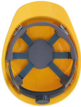
Ratchet-type X Clockwise closes assembly Counterclockwise opens assembly