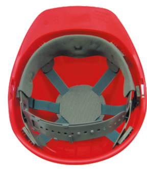
Pinlock-type Z Separate nape straps to adjust Unite nape straps to tight