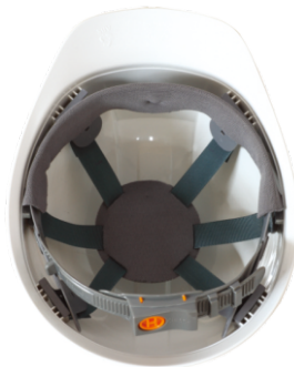
Buckle-type Y Press buckle to slide tail Loosen buckle to tight