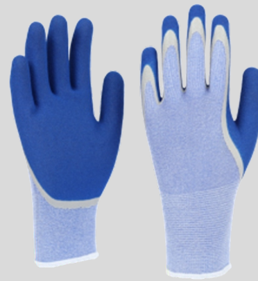
Model No. 09