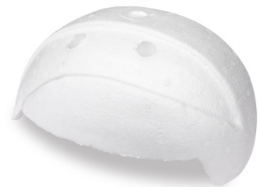
Eps Inner Shell