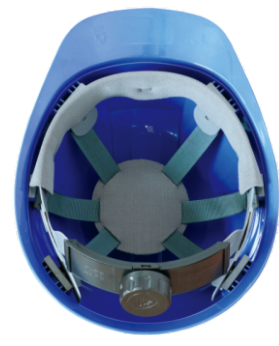
Ratchet-type T Pull out to adjust Press to lock tight