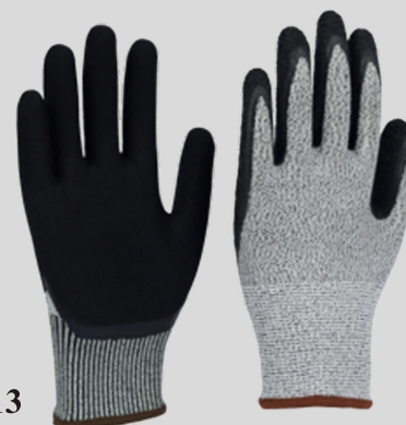
Model No. 12