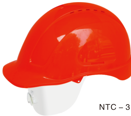
NTC – 3