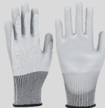
Model No. 11