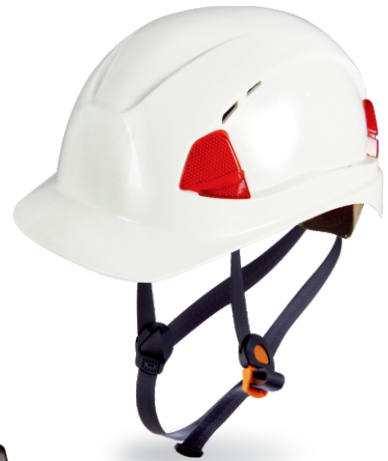
( Reflector )