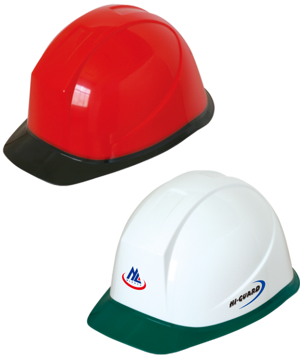
NTB - 2

Our particular safety helmet "Hi-guard" is adopted hot runner and two-color injection technology. There are many different color combinations between the visor and the shell for your option. Colorful choices add distinction and help differentiate the wearers in the workplace.