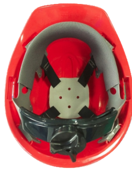
Ratchet-type K Clockwise closes assembly Counterclockwise opens assembly