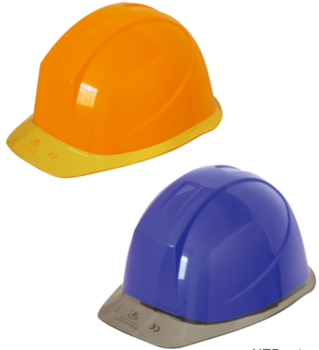
NTB - 1

ANSI Z89.1: 2003 Type I Class G & C GB 2811-2019