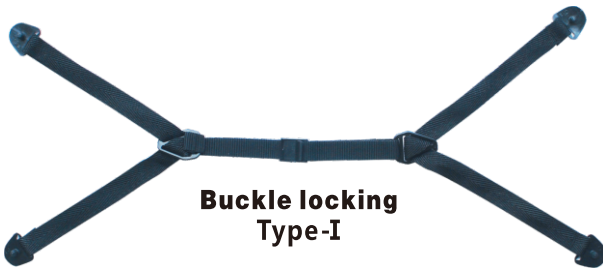
Buckle locking Type-I