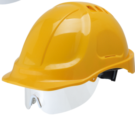
NTC – 5

Conform to the standard: ANSI Z87.1-2015