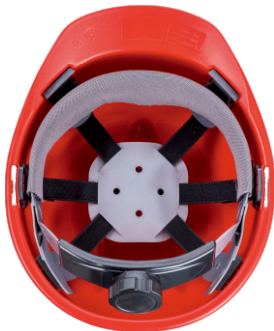
Buckle-type M Clockwise closes assembly Counterclockwise opens assembly