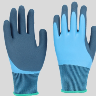
Model No. 10