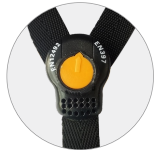
Adjust ratchet for EN397 and EN12492