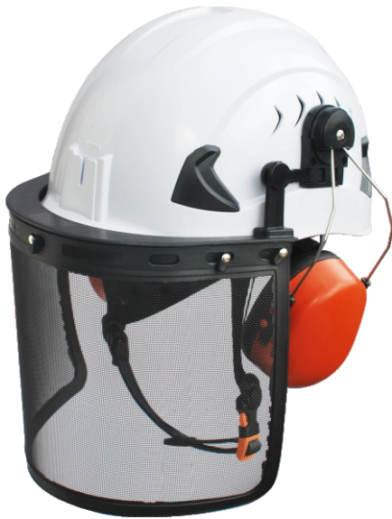
NT22-5V + Earmuff, Mesh Face Shield